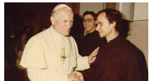
Pope John Paul II meeting then Fr. Robert Prevost (Pope Leo XIV)